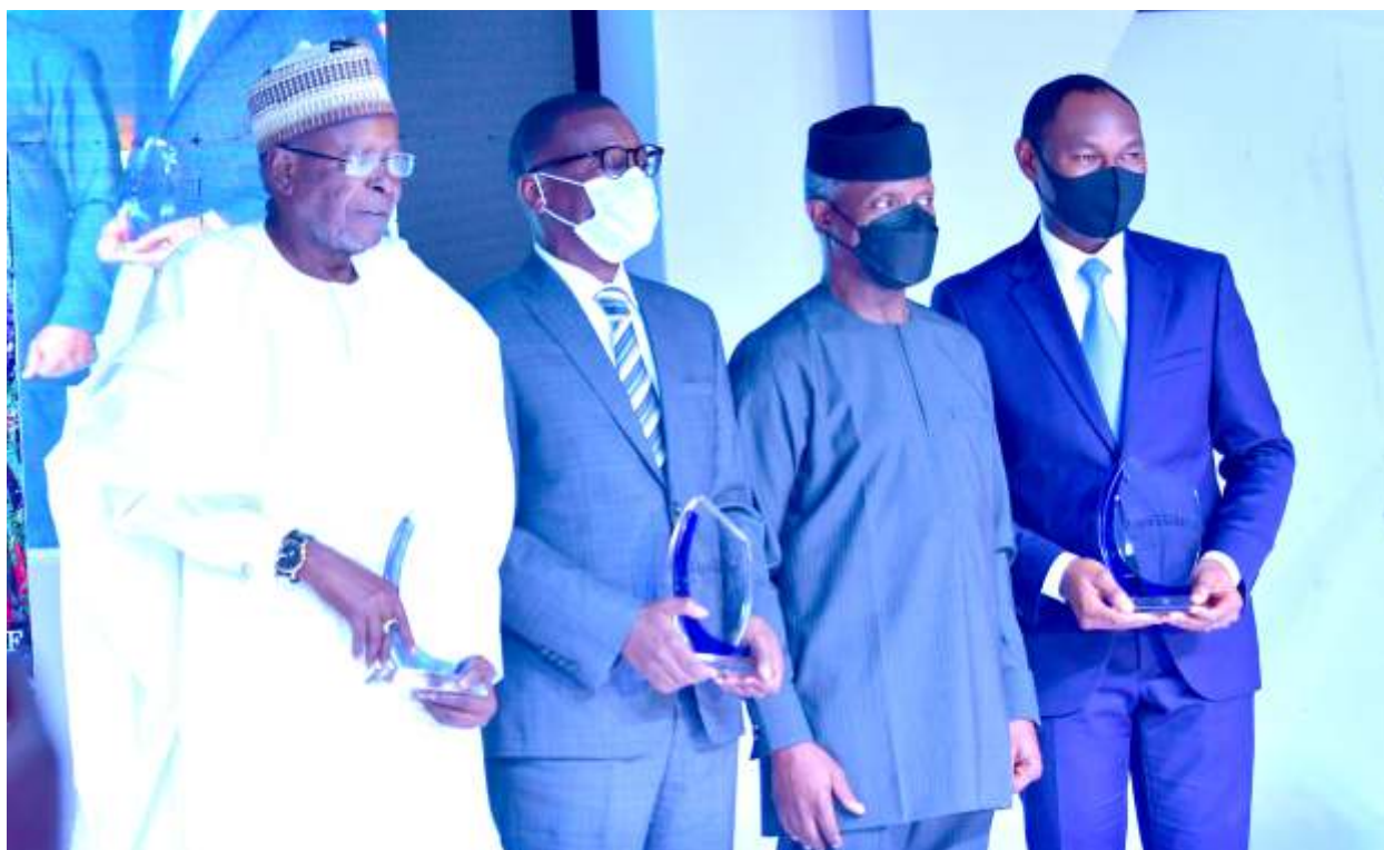
Vice President Yemi Osinbajo with some award recipients at the awards ceremony.