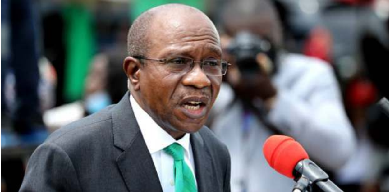
Governor, Central Bank of Nigeria, Mr. Godwin Emefiele

T he Governor, Central Bank of Nigeria (CBN), Mr. Godwin Emefiele has disclosed plans by the Bank to establish the Nigerian International Financial Centre (NIFC), which will act as an international gateway for capital and investments, driven by technology and payment system infrastructure.