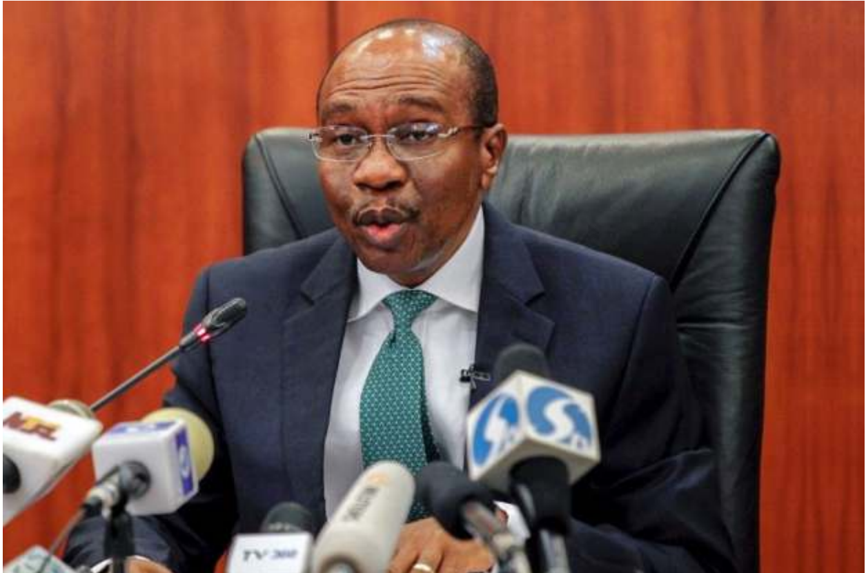
Governor, Central Bank of Nigeria, Mr. Godwin Emefiele addressing the press

The Governor of Central Bank of Nigeria (CBN), Mr. Godwin Emefiele, has said that with the continuous improvements in the nation's economy, closing the output gap brought about by COVID-19 slipping the economy into recession in 2020, Nigeria's Gross Domestic Product (GDP) is expected to rise between 2.5 percent and 3 percent by the end of 2021.