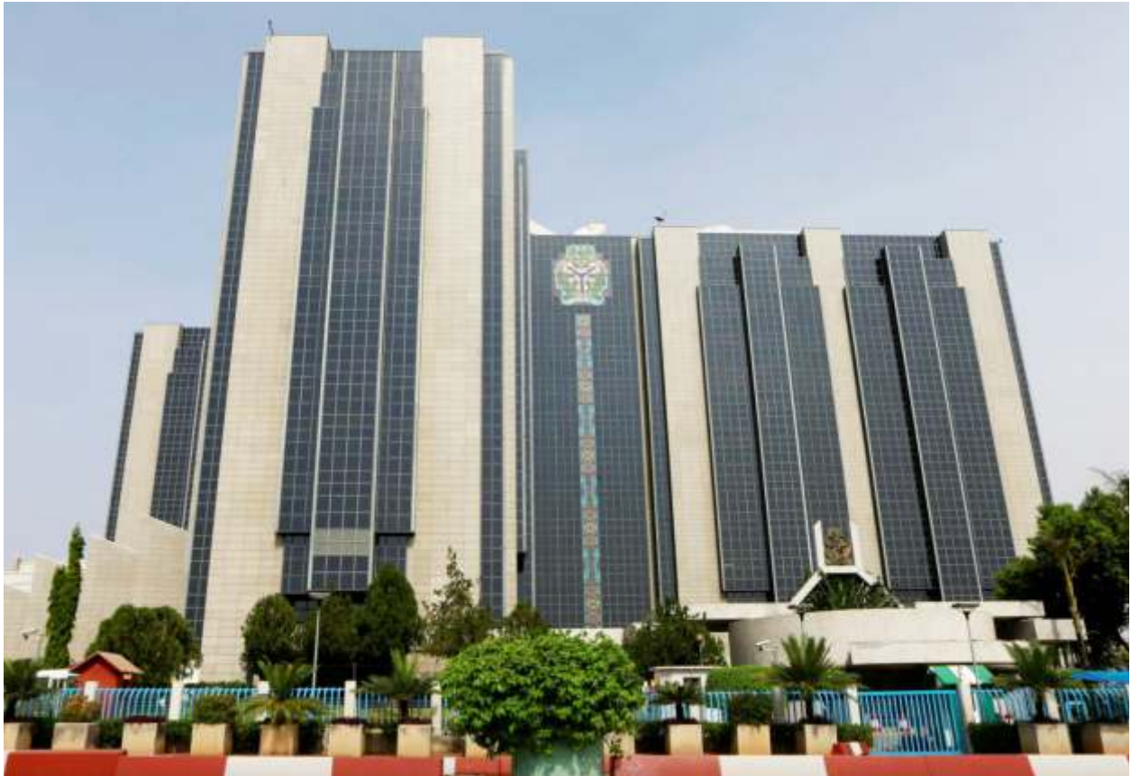
Central Bank of Nigeria Headquarter, Abuja

The Central Bank of Nigeria (CBN) has warned all Microfinance Banks (MFBs) in the country to cease from going beyond the provisions of their operating licenses by engaging in Non-Permissible Activities, especially wholesale banking and foreign exchange transactions.