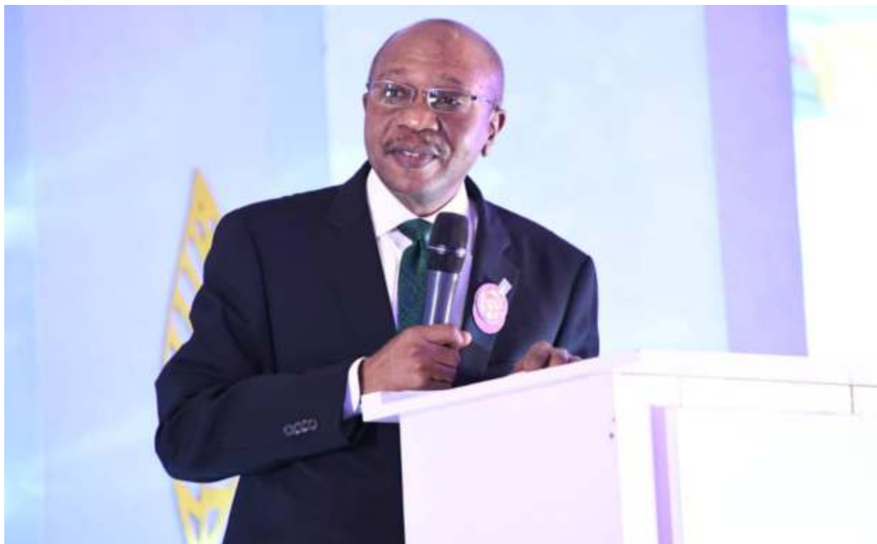
Governor, Central Bank of Nigeria, Mr. Godwin Emefiele giving a speech during the Excellence Award

T he Governor, Central Bank of Nigeria (CBN), Mr. Godwin Emefiele has been conferred with a 'HeforShe Excellence Award' for championing the issues of women, children and persons living with disability in the country.